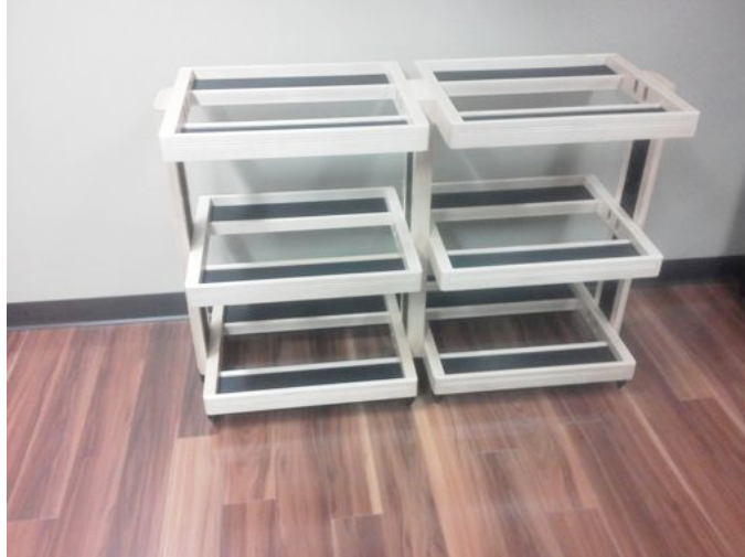
Picture 13 Completed Double Wide Stands

You are now ready to load the HRS Isolation Bases and equipment into the RXR frame system. The RXR has a 200 lbs maximum weight limit per level and a total vertical weight limit of 600 lbs. See the chart below for clarification.