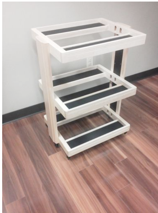
Picture 12 Completed Single Wide Stands

Step 8. At this point the RXR Frame is completely assembled. (See Picture 12.) Flip the RXR Frame upright, move the frame to the exact final location for use in your system. Make sure the front of the frame is (the side with the grooves on the Primary Supports) facing into the room. You are now ready to level the RXR frame. Place a level on the top Primary Support. Rotate the RXR Point on the bottom of the stand counter clock wise (clock wise if viewed from the top of the stand) as required to level the stand and make it stable (contact with floor at all eight locations). Make sure you do not rotate the RXR Points out more than 4-5 complete rotations. The RXR Points must have three (3) complete rotations of engagement remaining on the threaded strut for proper performance and strength. If more adjustment is required use a shim under the RXR Points so that the additional travel is achieved without violating the three (3) full thread minimum engagement requirement. When the stand frame is level, hold the RXR Point with one hand and screw the RXR Locking Nut with your other hand back into the top of the RXR Point and torque as much as possible with your hands. This will lock the RXR Points into place and take any motion out of threaded connection. The result should be a very stable, firm, and level frame structure.