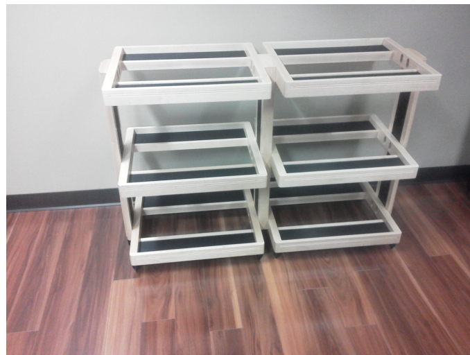
Picture 13 Completed Double Wide Stands