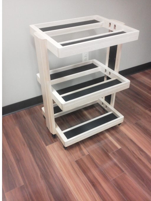
Picture 12 Completed Single Wide Stands