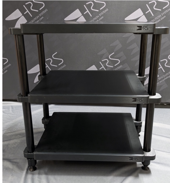
A completed EXR-1921-3V-080-080-B on HRS floor protectors

Step 9. Assembly of the EXR Audio Stand System is now complete. Carefully lift and flip the EXR upright and move it to the desired final location for use in your system. Depending on the size of your audio stand, this may require multiple people. Make sure to orient the audio stand system so that the front face with the HRS logo(s) faces forward. The stand points should be placed directly on carpeted floors. Place them on HRS Floor Protectors (sold separately) instead if your system is located on wood flooring or another surface you wish to guard against scratching. Please contact your dealer or HRS if you require HRS Floor Protectors.