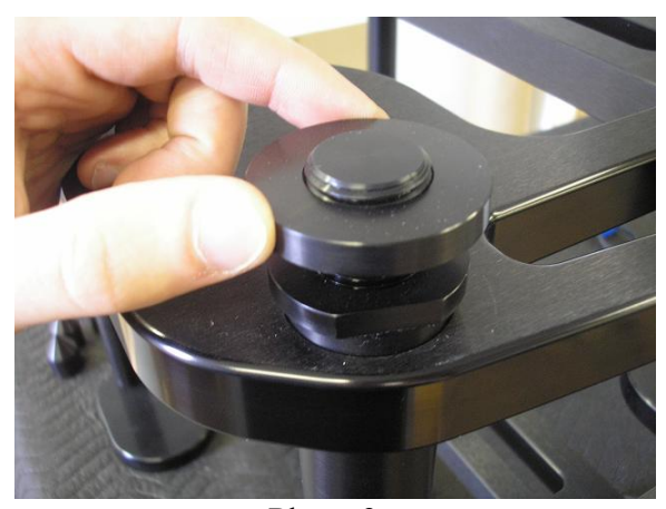
Step 9. Thread on the Washers just until they contact the Locking Nuts (photo 9), and then thread on the Points just until they contact the Washers (photo 10). Do not torque the Washers or Points tightly.