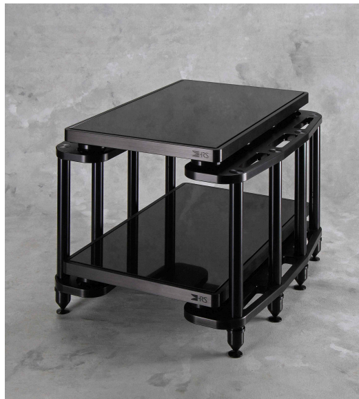
Completed SXRC-1929-2-2V-120-B with HRS M3X2-1929-2 Isolation Bases.

Make sure that the HRS Isolation Base feet are located securely in the pockets of the SXRC Horizontal Support Assembly. This will automatically occur when the front and back edges of the HRS Isolation Base is in line with the front and back faces of the SXRC Audio Stand. If the front and back edges do not line up with the front and back of the SXRC Audio Stand, contact Harmonic Resolution Systems or your local authorized HRS dealer.