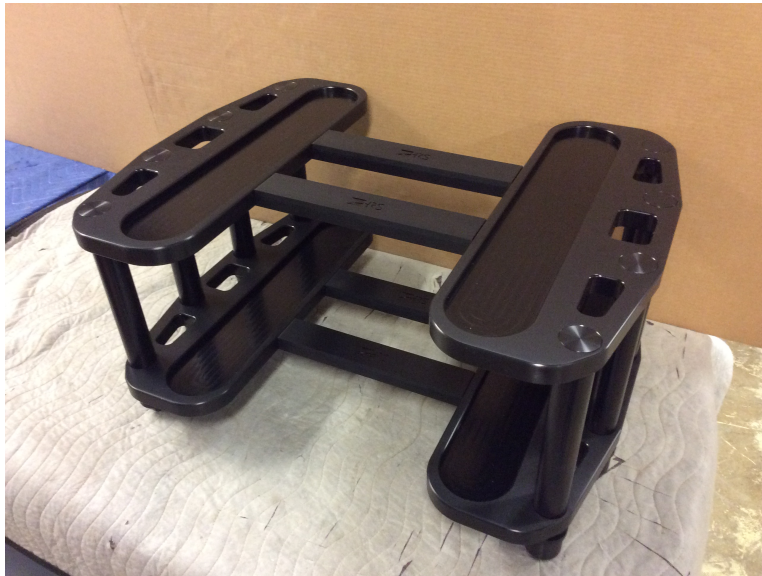
A fully assembled SXRC-1921-2-2V-080-B

Step 10. Assembly of the SXRC Audio Stand is now complete. Carefully lift and flip it upright, and move it to the desired final location for use in your system. Depending on the size of your SXRC Audio Stand, this may require multiple people. Make sure to orient the SXRC Audio Stand so that the HRS logos on the SXRC Crossmembers are right-side-up when read from in front of the system. The stand Points should be placed directly on carpeted floors. Place them on the included HRS Floor Protectors if your system is located on wood flooring, or another surface you wish to guard against scratching.