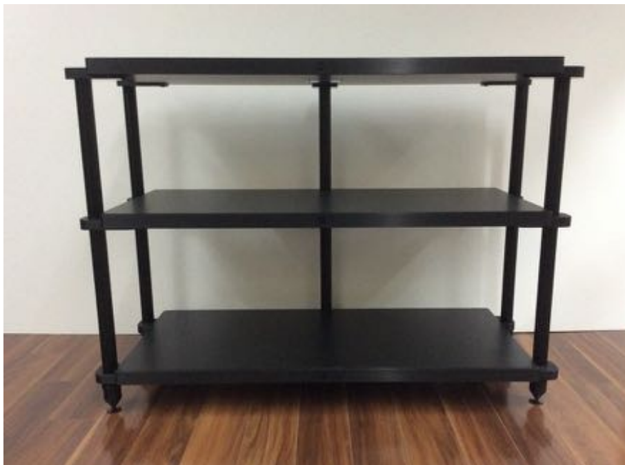
A completed EXRD-1942-3V-140-120-B on HRS Floor Protectors

Step 10. Assembly of the EXRD Audio Stand System is now complete. Carefully lift and flip it upright, and move it to the desired final location for use in your system. Depending on the size of your EXRD Audio Stand System, this may require multiple people. Make sure to orient the EXRD Audio Stand System so that the front face with the HRS logo(s) faces forward. The Points should be placed directly on carpeted floors. Place them on HRS Floor Protectors (sold separately) instead if your system is located on wood flooring or another surface you wish to guard against scratching. Please contact HRS or your authorized HRS dealer if you require HRS Floor Protectors.