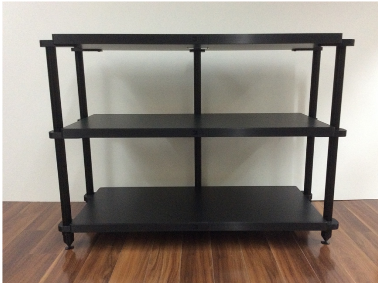
A completed EXRD-1942-3V-140-120-B on HRS floor protectors

Step 10. Assembly of the EXRD Audio Stand System is now complete. Carefully lift and flip the EXRD upright and move it to the desired final location for use in your system. Depending on the size of your audio stand, this may require multiple people. Make sure to orient the EXRD Audio Stand System so that the front face with the HRS logo(s) faces forward. The Points should be placed directly on carpeted floors. Place them on HRS Floor Protectors (sold separately) instead if your system is located on wood flooring or another surface you wish to guard against scratching. Please contact your authorized HRS dealer, or HRS, if you require HRS Floor Protectors.