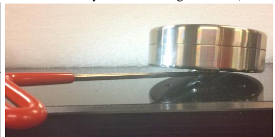
Adjusting the V-150A model using a 1/8" T-wrench