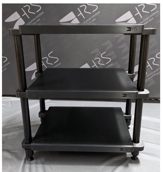
A completed EXR-1921-3V-080-080-B on HRS Floor Protectors

system so that the front face with the HRS logo(s) faces forward. The stand Points should be placed directly on carpeted floors. Place them on HRS Floor Protectors (sold separately) instead if your system is located on wood flooring or another surface you wish to guard against scratching. Please contact HRS or your authorized HRS dealer if you require HRS Floor Protectors.