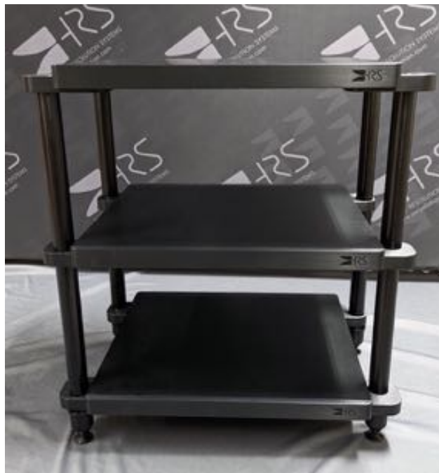
A completed EXR-1921-3V-080-080-B on HRS Floor Protectors

Step 10. Assembly of the EXR Audio Stand System is now complete. Carefully lift and flip it upright, and move it to the desired final location for use in your system. Depending on the size of your EXR Audio Stand System, this may require multiple people. Make sure to orient the EXR Audio Stand System so that the front face with the HRS logo(s) faces forward. The Points should be placed directly on carpeted floors. Place them on HRS Floor Protectors (sold separately) instead if your system is located on wood flooring or another surface you wish to guard against scratching. Please contact HRS or your authorized HRS dealer if you require HRS Floor Protectors.