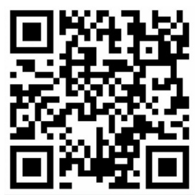
Scan here to register for HRS 5-year Limited Warranty

Harmonic Resolution Systems warrants the product designated herein to be free of manufacturing defects in material and workmanship, subject to the conditions herein set forth, for a period of 90 days from the date of purchase by the original purchaser. The purchaser is required to register the unit with Harmonic Resolution Systems by visiting https://avisolation.com/company-warranty/ and completing the limited warranty registration, within 14 days upon receipt of any HRS product. Scan QR code to register for HRS 5-year limited warranty.